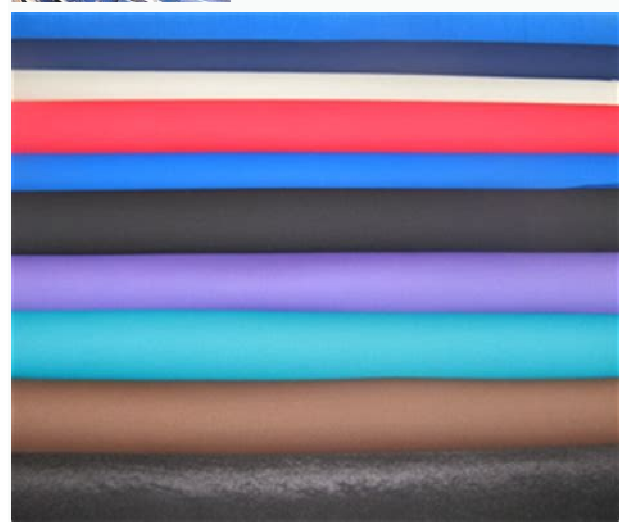
Rubber roof sheets suppliers. Neoprene rubber rate.